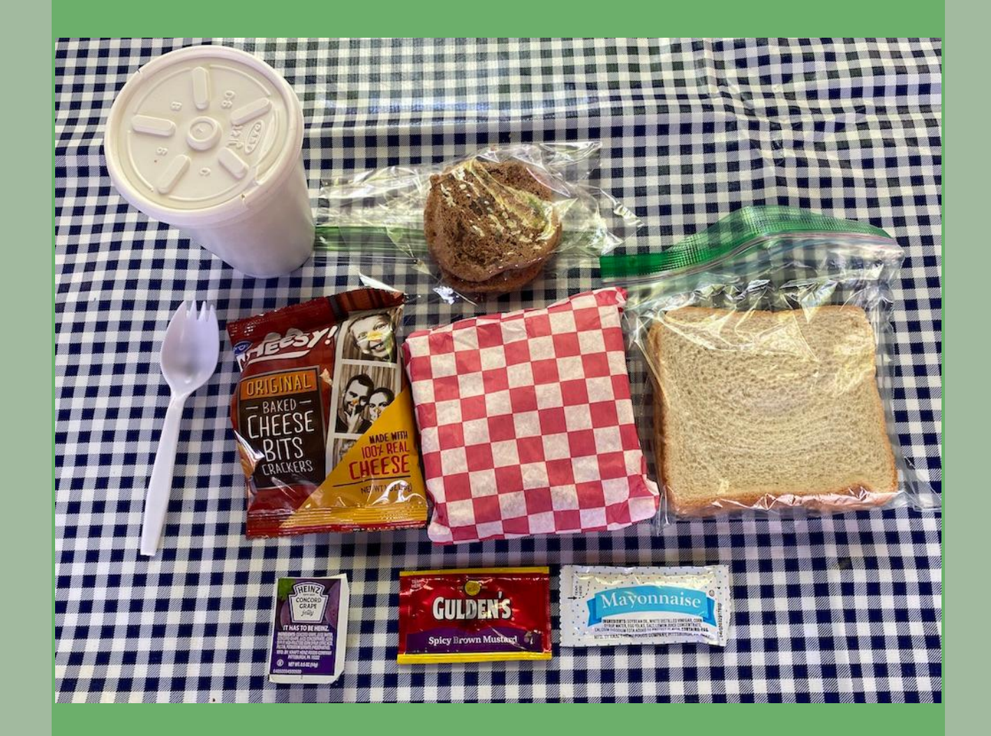
Photo above shows contents of a typical sack lunch. Our goal is to provide diners with